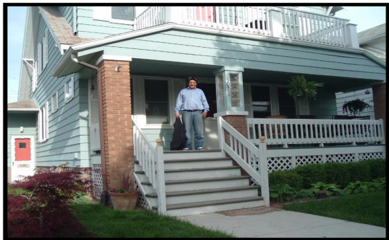
The Tag House

The TAG house was donated to the program and is located in the heart of Dearborn.