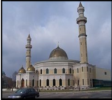
A Mosque in this Mid-West City