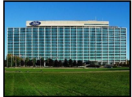
Ford World Headquarters.

The answer from above is Dearborn, Michigan.